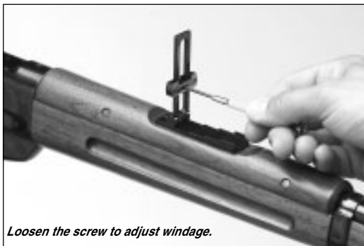
Loosen the screw to adjust windage.

The graduations from 800 to 1,800 yards are found on the topside of the sight ladder (Figure 2). For distances between 800 and 1,800 yards, the sight is designed to flip rearward to the upright position. The slide assembly can be slid up or down on the sight ladder to the desired yardage.